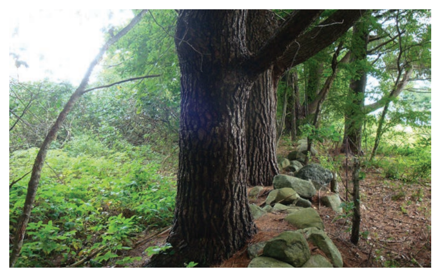
Stonewalls often mark both internal and external property boundaries as they do on the Field of Dreams conservation easement.

SELT utilizes existing survey lines and markers, city/town parcel data, maps, field visits, aerial photos, compass and GPS for locating easement boundaries during field visits. Marking the boundaries makes identifying the boundaries during easement monitoring easier and readily allows current and subsequent landowners—and neighbors—to know where the easement borders are.