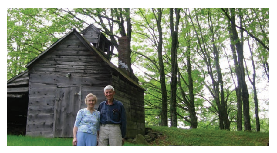
SELT's Conservation Easement Stewardship Fund will help us to uphold our commitment to ongoing stewardship for all of the conservation easements we hold. This will ensure the property remains forever protected as the original Grantor's intended.

SELT has established the Conservation Easement Stewardship Fund, a dedicated fund for easement stewardship. This fund is dedicated solely to covering the cost to manage, monitor, and enforce its conservation easements. For each easement, the Land Trust requires a minimum of $10,000 for this purpose to be obtained as part of the project costs. Contributions to the Conservation Easement Stewardship Fund may come from a variety of sources including municipalities, private individuals and foundations. Endowment contributions can be made at the time the easement is donated, at the time that reserved rights are exercised, or an amount can be pledged and paid over a period of years.