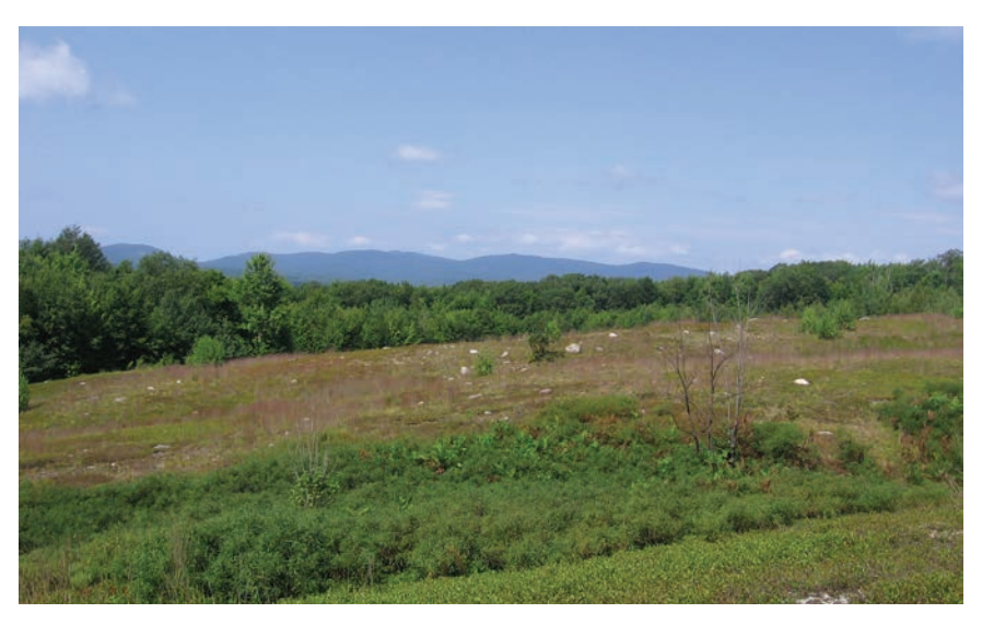
Existing land cover and land use, such as the forest land and commercial blueberry fields on the Panish conservation easement, is an example of what is typically documented for baselines.

Once the baseline is finalized the landowner and other interests receive a copy and SELT keeps the original stored in a secure, fireproof file cabinet. We recommend that you keep your copy in a safe but easily accessible location.